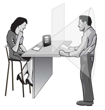
Figure 1 : Typical counter / ticket booth application